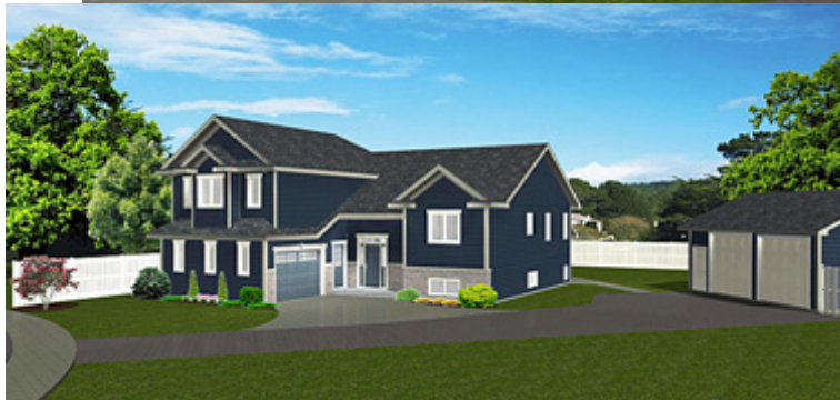
Front Right Elevation